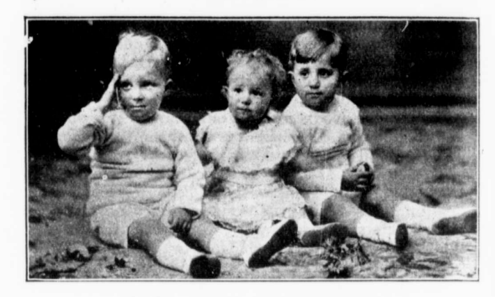
Children of Alfonso XIII, King of Spain.