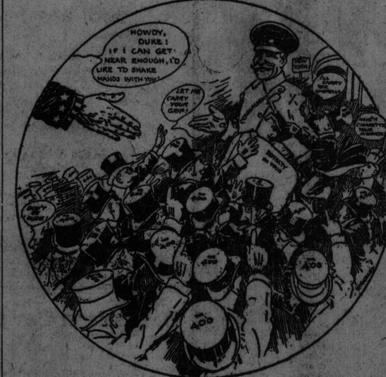
Chicago view of the Connaught visit, as seen by Bradley in the Chicago News.