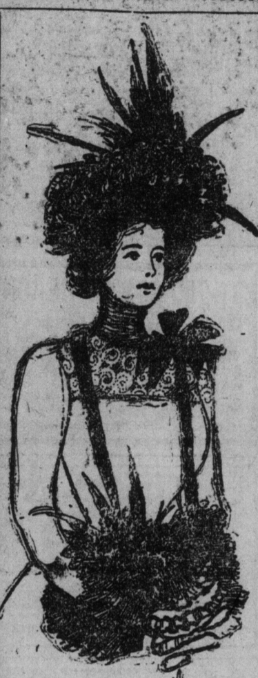
Latest New York style Black Gaufréd Taffeta Silk and Velvet Set, hat and muff... 19.50