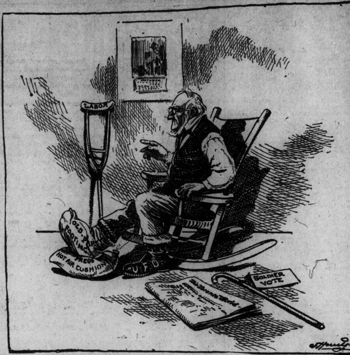
Old Man Ontario: One bum foot don't count so much when a fella's got both a crutch and a cane.