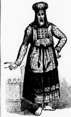
The High Priest

what name is He called? 4. What did the High Priest do in olden times? 5. Of what were the sacrifices and offerings pictures? has come, nobody, however bad, need be 6. Where are they told about? 7. Who was one of the old High Priests? 8. How often