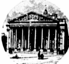
Head Office: Royal Exchange, London

Correspondence invited from responsible gentlemen in un- represented districts re fire and casualty agencies.