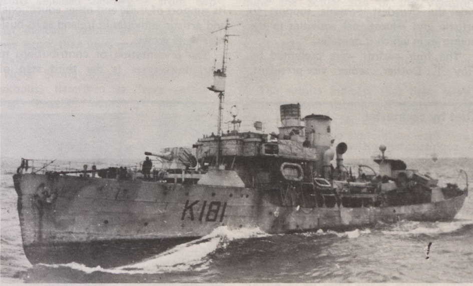
The Canadian corvette, HMCS Sackville, shown here at sea in 1943. The ship is the only one still existing of Canada's wartime fleet of 123 corvettes.

HMCS Sackville , the sole survivor among Canada's fleet of 123 corvettes from the Second World War, has been taken out of service by the Canadian navy, but retired naval officers are moving ahead with plans to ensure its preservation.