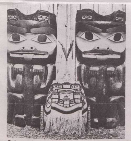
Grizzly Bear house posts at Masset. (Maynard, 1884)

Encyclopaedic in scope, Haida Monumental Art is considered to be valuable