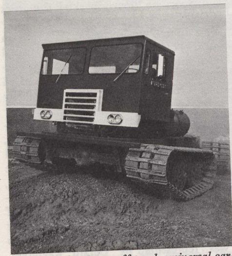
Over 100 of these off-track universal carriers, made by Canadian Foremost Ltd., of Calgary, have been sold to the U.S.S.R.

The Corporation's insurance support – surety, export credits insurance and foreign investment guarantees – increased in volume to over $3 billion in 1978 from