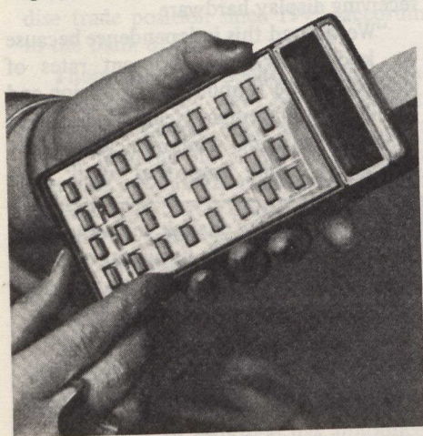
Keypad used for calling up "pages" of information for display on TV.

Bown and his team built further flexibility into Telidon so that a number of component parts could be used depending on the degree of sophistication needed. A user could, for example, phone a data bank and by punching a few buttons on a keypad retrieve pages of information for display on his modified TV set.