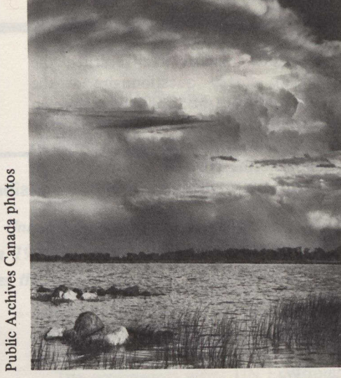
Two of Royal's photographs in the Archives exhibition: Indian Church near Lillooet, B.C. (1969). and Storm over Lake Winnipegosis, Manitoba (1967).

Royal produced the photographs shown in this exhibition.