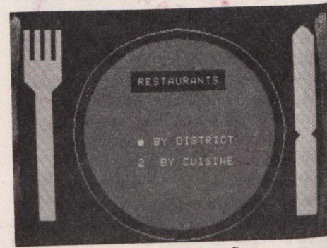
Dining out? Check Telidon first.