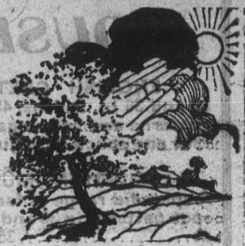
AFTER CLOUDS COMES SUNSHINE. AFTER DEPENCY COMES JOY. AFTER SICKNESS COMES HEALTH. AFTER WEAKNESS COMES STRENGTH.

In the spring when you're "all in"—fagged out—blood thin, if you will turn to Nature's remedy, a tonic made from wild roots and barks, which has stood fifty years as the best spring tonic—you will find strength regained. No need to tell you it's Dr. Pierce's Golden Medical Discovery, put up in tablet or liquid form, and sold by every druggist in the land. After a hard winter—shut up indoors, your blood needs a temperance tonic, a tissue-builder and blood-maker such as this "Medical Discovery" of Dr. Pierce's.