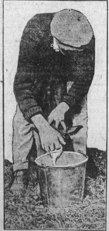
Teaching Calf to Drink, Showing Two Fingers In Mouth.

When the calf is started on calf meal the amount to be added varies with the size of the calf and the brand of meal. Directions included