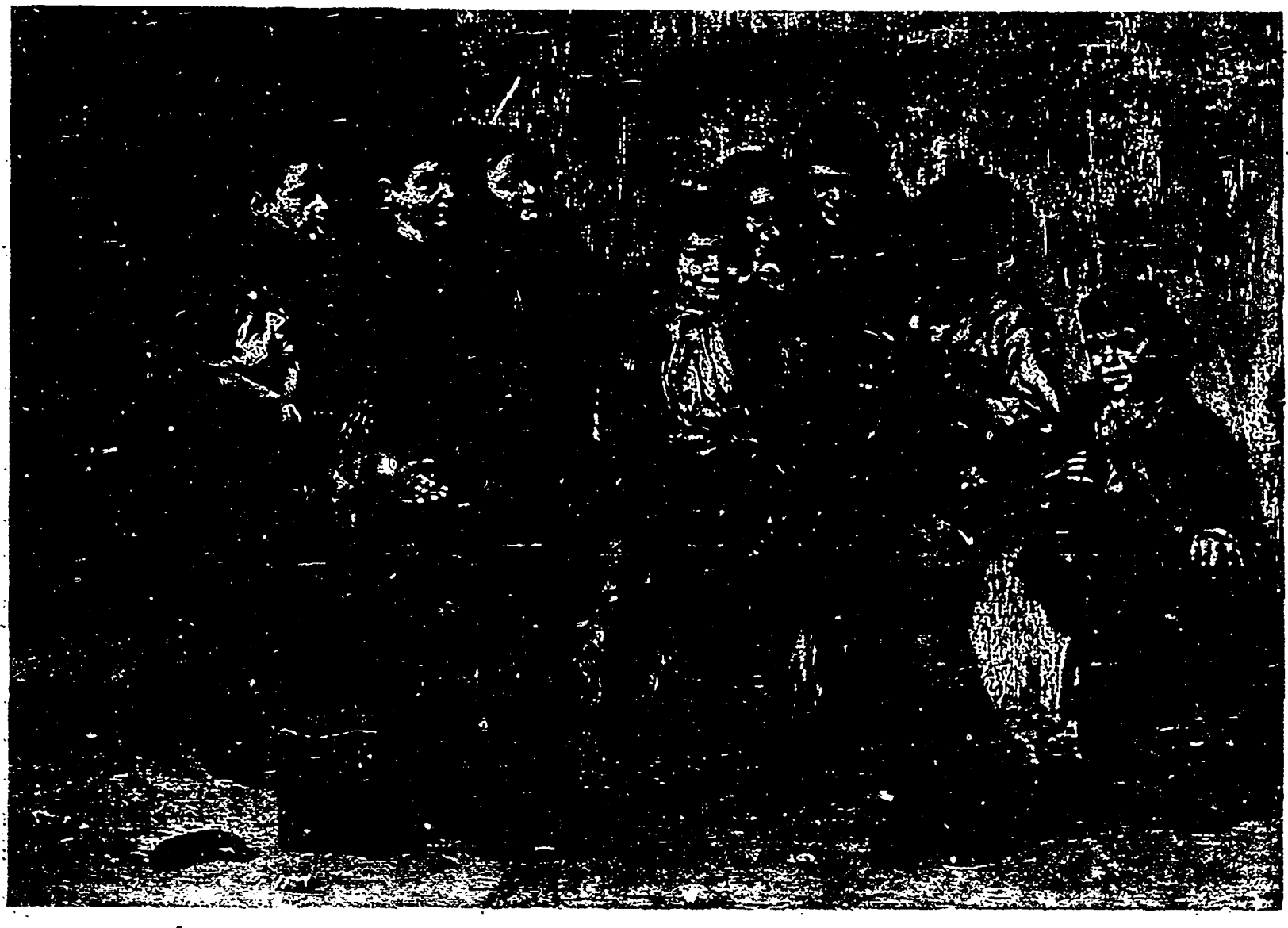
A GOOD STORY WELL TOLD.

dry rubbish in that little workroom an' started the whole thing in a blaze. We just stood starin' at each other an' at the openin', all but one. The little sergeant, he give a quick cry that, as I mind it now, was half a prayer, an' sprung forward right into that blaxin' room, and we that had followed him, slower and dazed like, thought he had