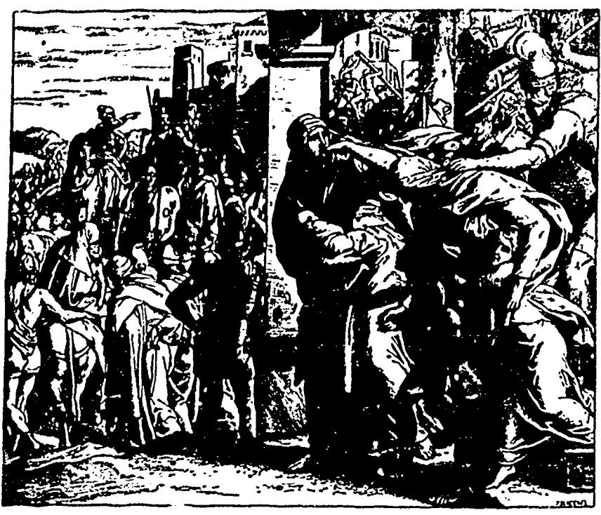
CAPTIVITY OF THE ISRABLITES.