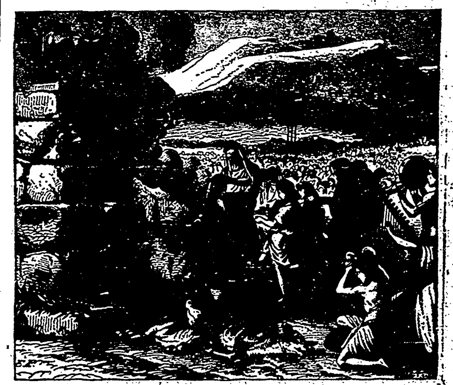
"TREY SET UP THEIR HEAGES ON RVERY HIGH HILL—THEY SERVED IDOL."