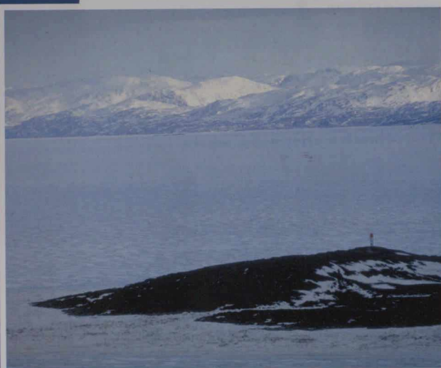
Arctic environment: High levels of toxic chemicals are finding their way into the northern food chain.

When Sheila Watt-Cloutier talks to international policy makers about the impact of toxic chemicals on the Inuit, she speaks from the heart. As a child growing up in the late 1950s and early 1960s in Kuujjuaq, a small Inuit village in northern Quebec, Watt-Cloutier led a traditional life, travelling by dogsled and canoe and eating “country foods” such as caribou, ptarmigan, fish, goose, seal and whale.