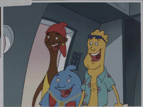
illustrations courtesy of Firdaus Kharas

Such broadcasts are part of a larger public education campaign that includes local distribution of tapes of the announcements. In South Africa, the Canadian International Development Agency is contributing $100,000 to an HIV/AIDS prevention initiative in which tapes of the announcements in Zulu, Afrikaans,