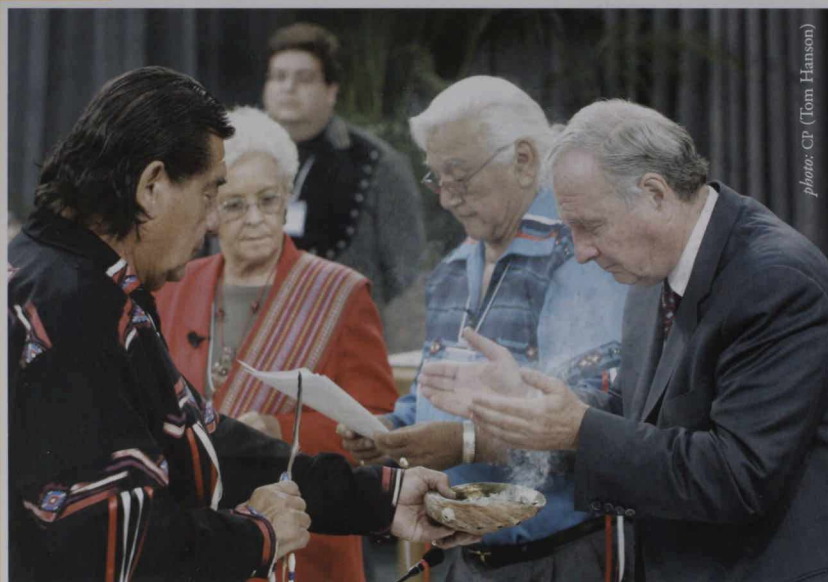
New relationship: Prime Minister Paul Martin takes part in an Aboriginal smudging ceremony before the start of the First Ministers Conference on Health in Ottawa.

Canada has led or supported a number of national and international projects and initiatives related to the Decade. In 2002, for example, representatives of about 20 Canadian Aboriginal organizations and non-governmental organizations took part in the inaugural meeting of the UN Permanent Forum on Indigenous Issues, one of the Decade's prime objectives. Canada is one of only two countries with two of its nationals, Wayne Lord and