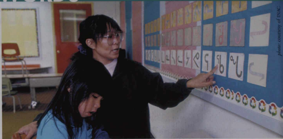
Starting young: The challenge is to find a context in which language learning is successful.

The scientific community has warned that such historical assimilation campaigns—combined with