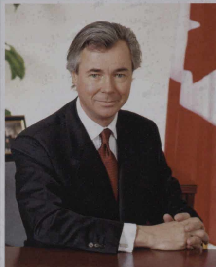
Foreign Affairs Minister Pierre Pettigrew

A former consultant to companies with dealings in international markets, Mr. Pettigrew served as Foreign Policy Advisor to the Prime Minister from 1981 to 1984 and as Director of the Political Committee to the NATO Assembly in Brussels from 1976 to 1978. He holds a Bachelor of Arts degree in Philosophy from the Université du Québec à Trois-Rivières and a Masters of Philosophy degree in International Relations from Balliol College, Oxford University, United Kingdom. ♣