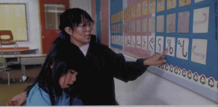
Starting young: The challenge is to find a context in which language learning is successful.

The scientific community has warned that such historical assimilation campaigns—combined with