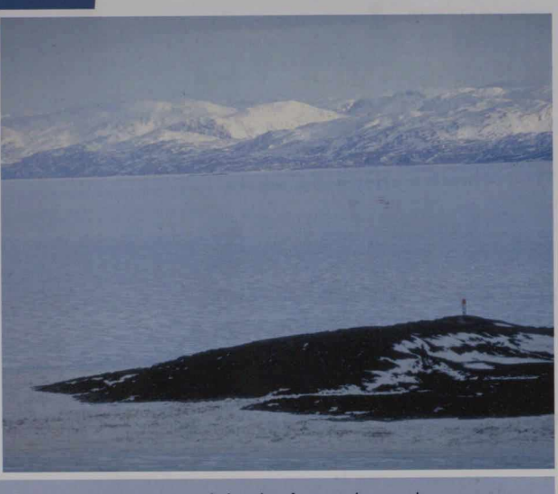
Arctic environment: High levels of toxic chemicals are finding their way into the northern food chain.

Inuit fight toxic pollution in the Arctic on the global stage.