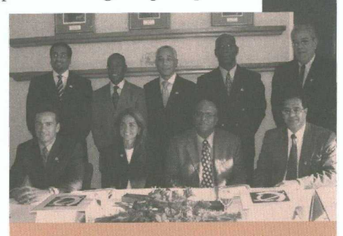
Officials from Nortel, LagTel and the Canadian Trade Commissioner Service at the official signing of the agreement.

Trinidad and Tobago's telecom initiative will further benefit from Canadian expertise through LaqTel's part-