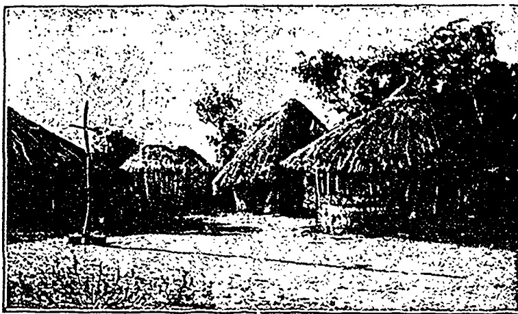
A MASHONA VILLAGE MARKED AS A MISSION STATION.