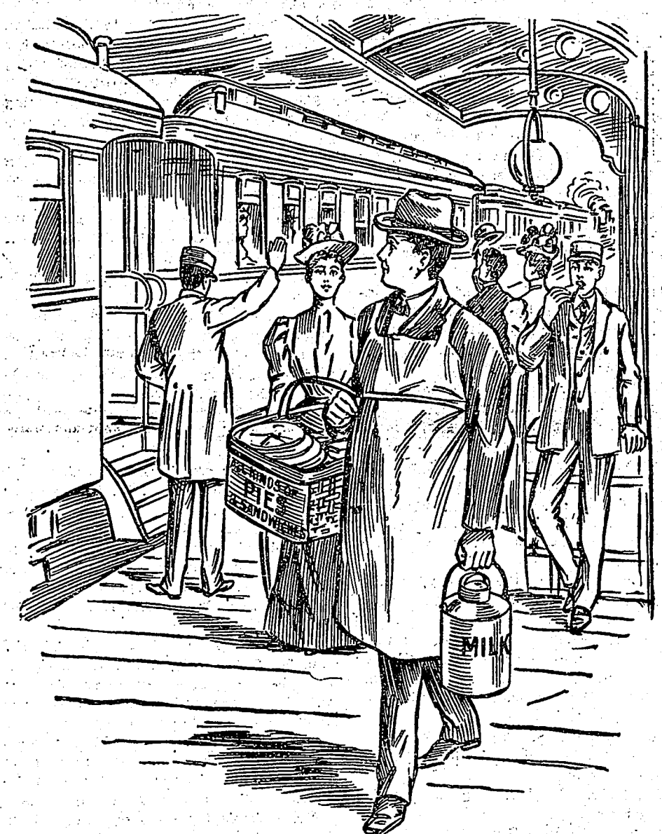
HE BEGAN TO PROVIDE LUNCHEON FOR THE TRAINMEN.