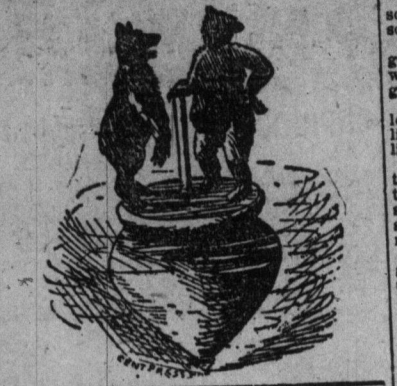
Suppose. "It's better than drugs," said the doctor.