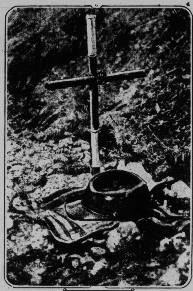
THE CROSS IS MADE OF THE HANDLES OF MESS TINS AND THE