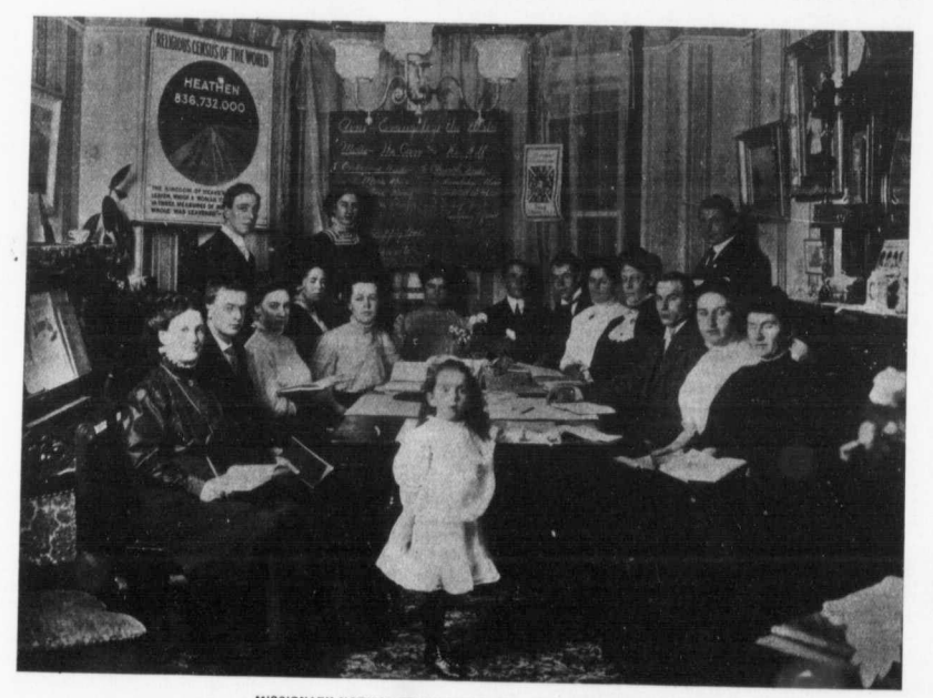
MISSIONARY NORMAL STUDY CLASS-TORONTO WEST DISTRICT

With the exception of the new league, every society on the district has organized the "Forward Movement," and that league hopes to do so early in the year. Toronto