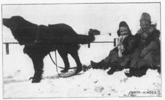
PEADY FOR SCHOOL

What Old Testament men did this? Who else do we read of in the New Testament who also stood firm under trial?