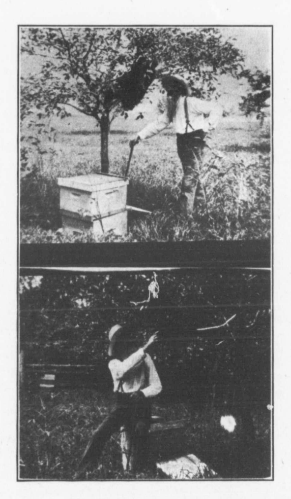
One of Mr. Haberer's late August swarms, large enough to fill a 10-frame hive. Two months later it was not more than a small nuclei. (See page —.)