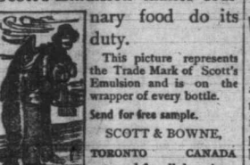
Send for free sample. SCOTT & BOWNE, TORONTO CANADA. 50c and $1. all druggists.

Sickly children need special feeding. They don't "feel their oats". Scott's Emulsion adds just the right richness to their diet. It is like grain to the horse. The child gets new appetite and strong digestion. Scott's Emulsion is more than food. It is a strong medicine. It rouses up dull children, puts new flesh on thin ones and red blood into pale ones. It makes children grow. Scott's Emulsion makes ordinary food do its duty.