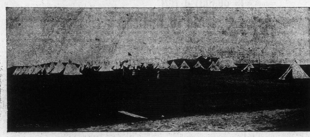
THE FIFTH REGIMENT CAMP AT MACAULAY POINT.