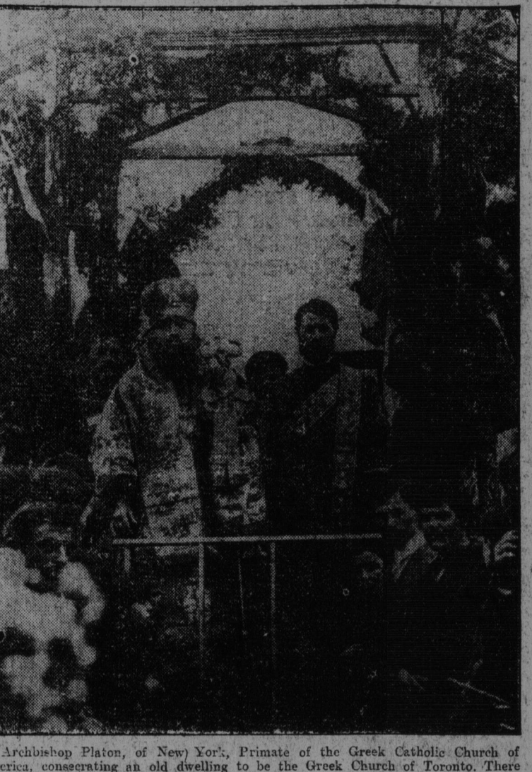
Archbishop Platon, of New York, Primate of the Greek Catholic Church of America, consecrating an old dwelling to be the Greek Church of Toronto. There is a large colony of Macedonians in Toronto.