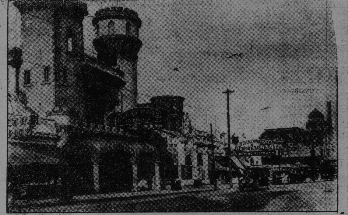
Coney Island, the New York play ground from a photograph taken just before Saturday's fire which did $3,000,000 damage.