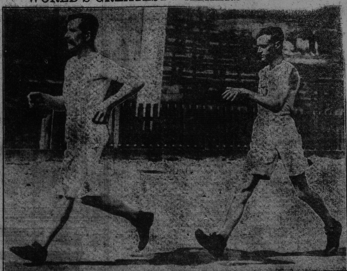
The world's two greatest walkers in action. George E. Larner, the Olympic champion, who is touring Canada, and George E. Larner, a Canadian champion, photographed together for the first time in the Dominion. Larner's style has been the cause of some criticism, from a Canadian standpoint, although Larner has passed the world's best judges and his own habit on walking is a recognized authority. In this picture he is only appearing to have a heel on the ground.