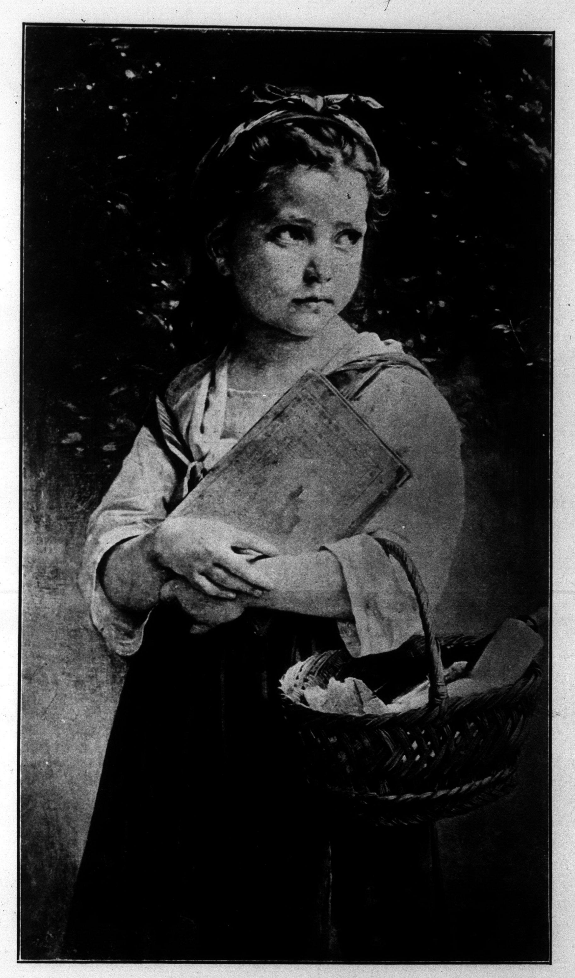
THE LITTLE SCHOLAR