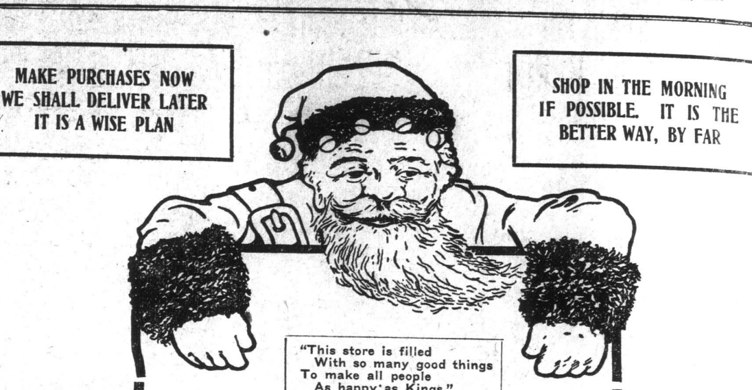
"This store is filled With so many good things To make all people As happy as Kings."

ORDER BY MAIL—WE GUARANTEE PERFECT SATISFACTION