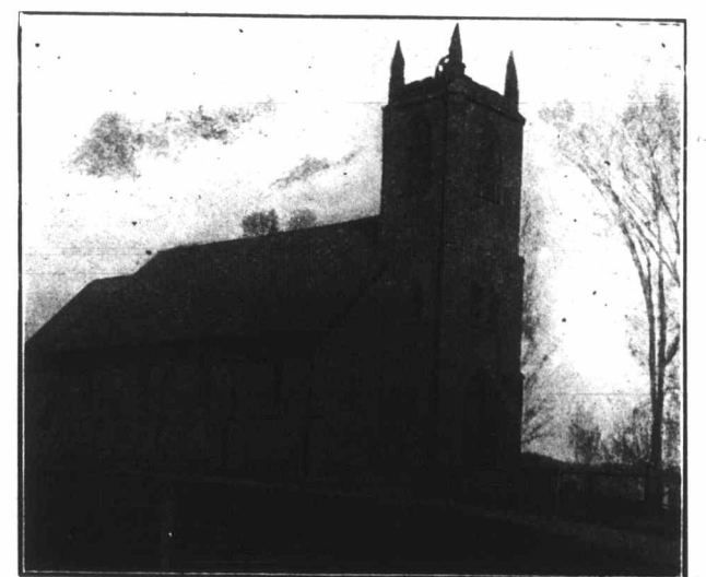
Church of St. John the Evangelist, Brome, Que.