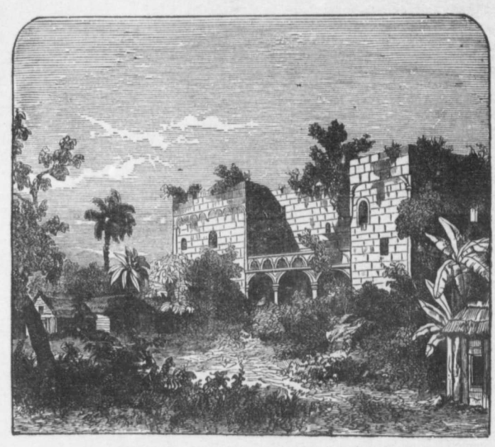
THE HOUSE COLUMBUS LIVED IN AT SAN DOMINGO,