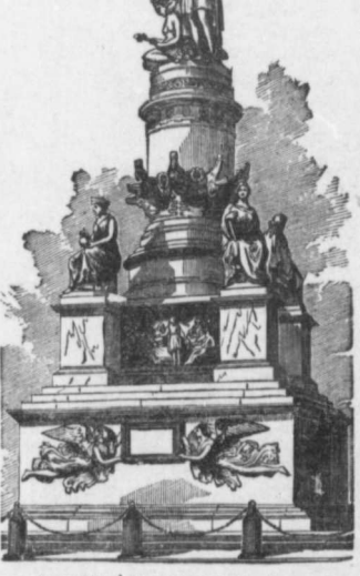
COLUMBUS' MONUMENT AT GENOA.

the numerous adventurers who followed him-of the extent of the American continent, connected with the announcement with which Europe was then ringing, of the final accomplishment of the great feat of the circumnavigation of Africa by Vasco da Gama in 1497, the genius of Columbus had conceived a new project, or rather a modification of his former one. This was the discovery of some strait lying between Hoduras and Paria, in about the situation of what is now known as the Isthmus of Darien and leading into the Indian Ocean. Having discovered this strait, he would sail through it, coast along the Indies to the shores of Arabia, and either sail up the Red Sea, and travel overland to Spain, or repeat Vasco de Gama's feat the reverse way, and reach