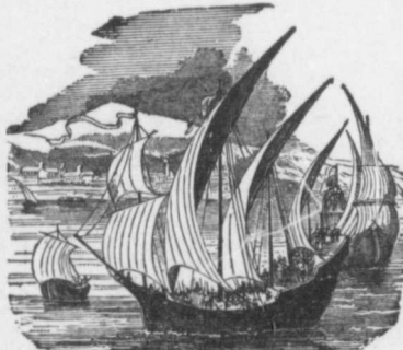
COLUMBUS SETS SAIL AT PALOS.