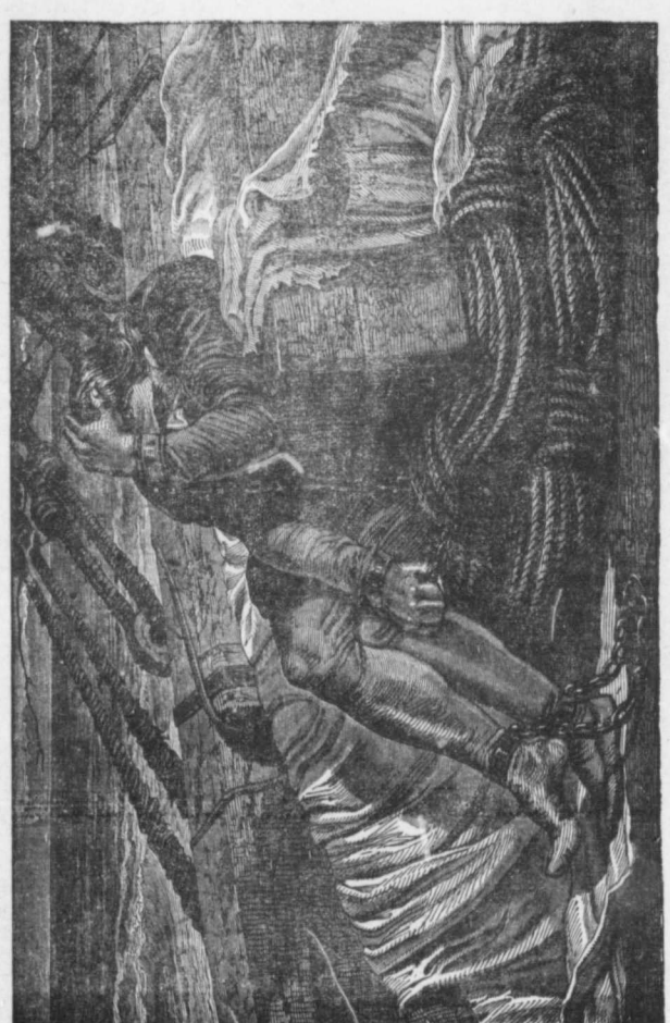
COLUMBUS IN CHAINS ON BOARD OF THE "GORDA,"