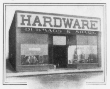
An Attractive Hardware Store, Wilkie

homesteaders are also disposing of their lan to farmers with capital. There is no doubt that under this new and still more prosperous regime the book accounts of the country