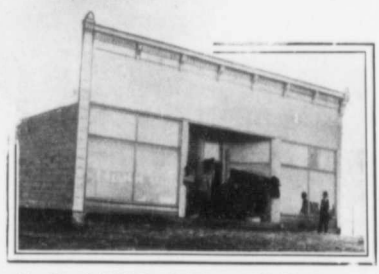
Two Months' Old Store of Hoggarth & Clendenan, Kerrobert, Saskatchewan

case a few years ago. In the first place, as has already been pointed out, transportation facilities and methods of communication have been greatly improved. Another, and probably the most important consideration, is the tremendous influx of settlers from all parts of the world, particularly from the Old Country and the United States. This will continue until the vast areas of the West are taken up. In place of the pioneer, who, a few years ago,