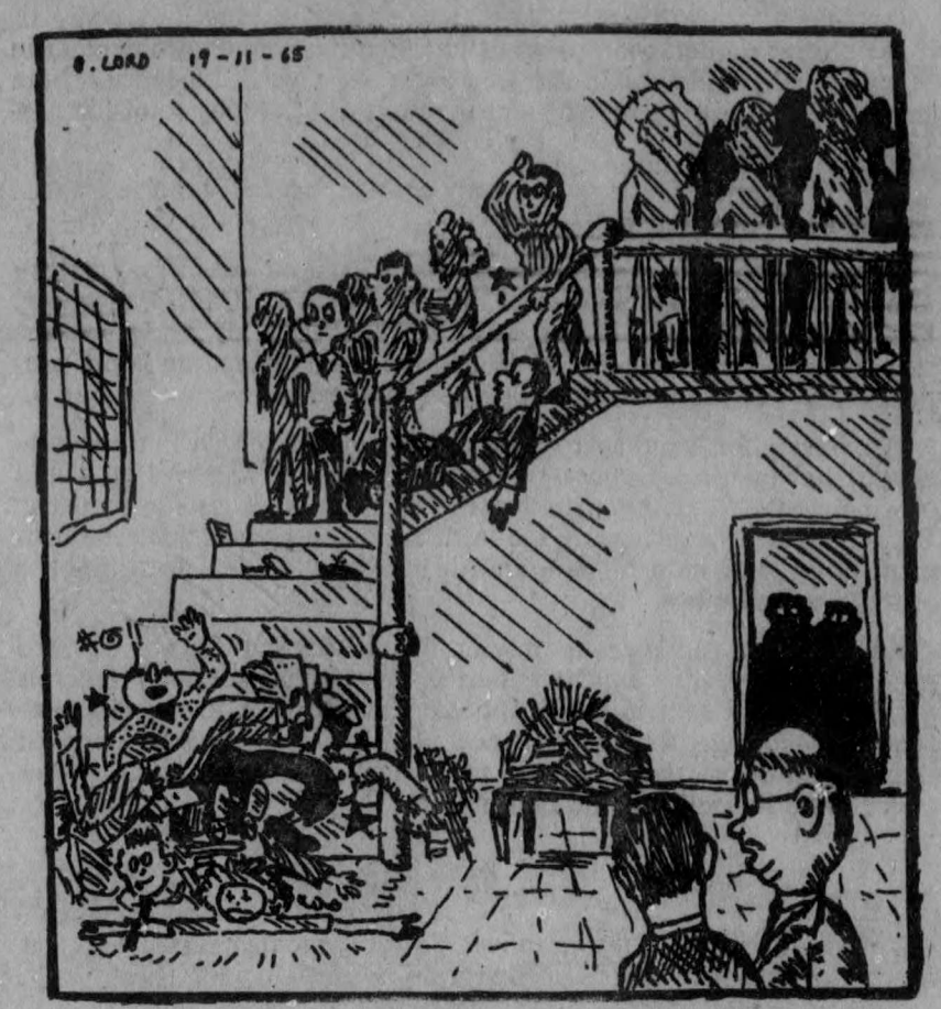
"We forgot the rotary sign again".

A bus has been chartered by UNB in Saint John to provide transportation for UNBSJ students to the gala affair.