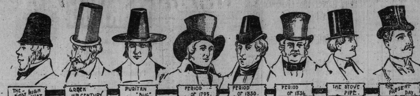
THE EVOLUTION OF THE HIGH HAT.