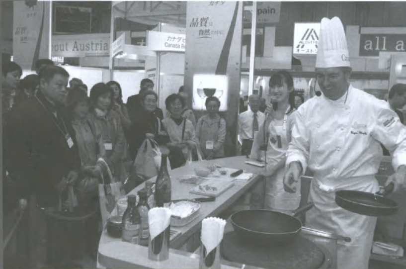
Leave them hungry for more: Trade shows can be great for business.

Not a week goes by that a particular business sector, industry or product type isn't being featured in a trade show. In fact, it is quite likely that more than one event will be competing for the same audience at the same time—potential clients and customers, media, and exhibitors of course. Whether it is called a trade show, an exhibition, an industry expo or some other creative name, the goal remains the same: bring businesses and customers together to encourage commerce.