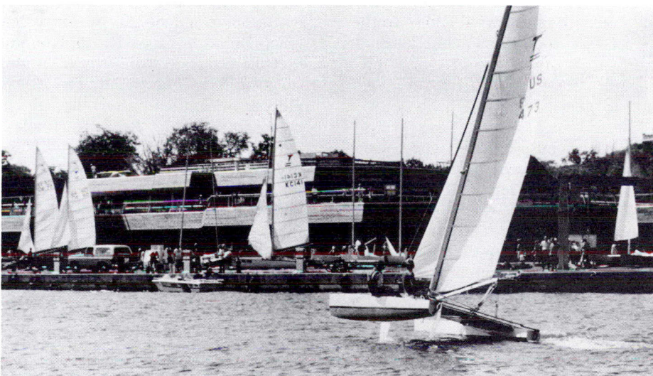
The Olympic Yachting Centre, Kingston, Ontario, is 185 miles west of Montreal.

The year 1975 was also notable for the Snowbirds; returning to the "Land of the Midnight Sun", the team, on May 11 performed a full display at midnight, at Inuvik. Throughout 1975 the team flew 74 shows at communities both large and small across Canada as well as at other major locations in the United States.