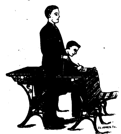
"Perfect Automatic" School Desk The Latest and Best

Preston, Ont. Successors to W. Stahlsehmidt & Co., Manufacturers of Office, School Church and Lodge Furniture.