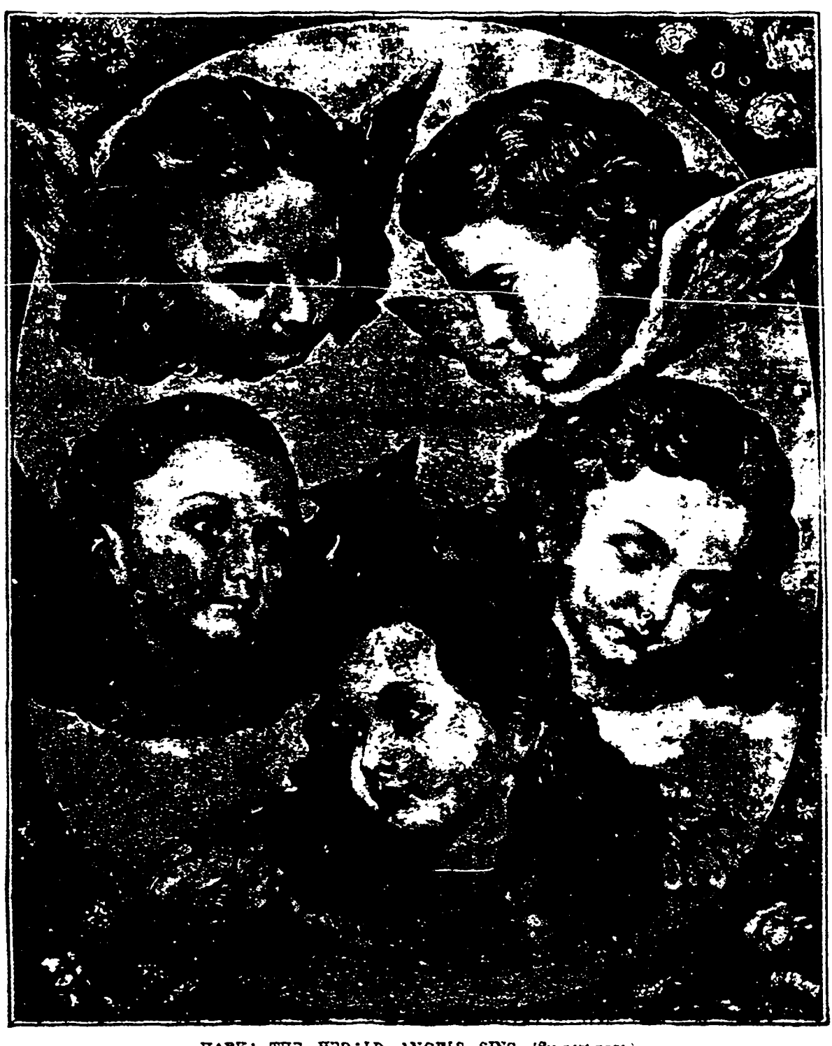
HARK! THE HERALD ANGELS SING-(See near page.)