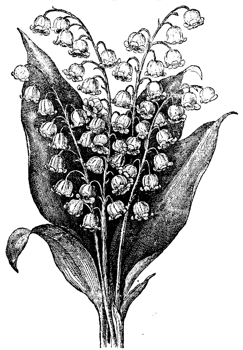
LILY OF THE VALLEY.

forcing house with a temperature of about fifty degrees, which is gradually increased to eighty degrees.