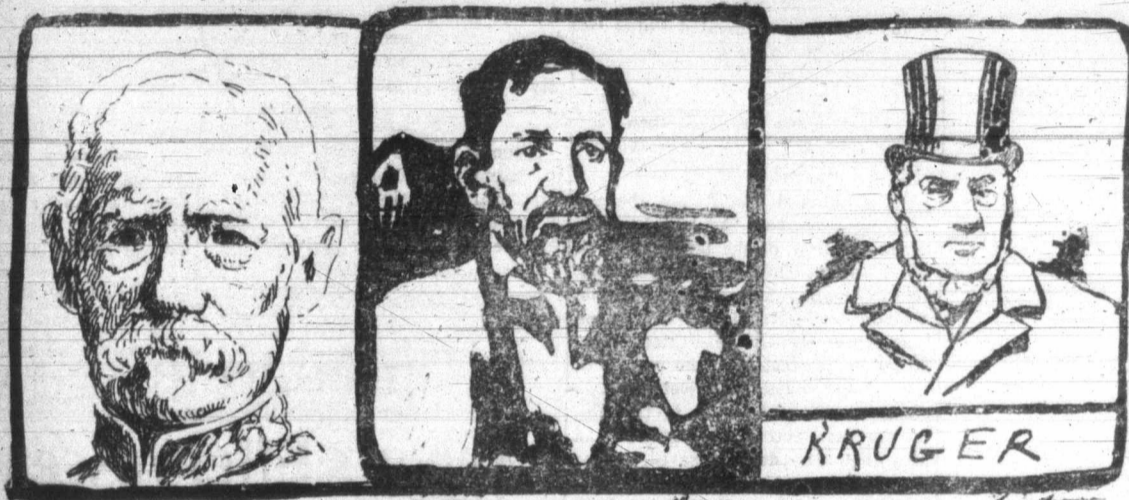
LORD ROBERTS GEN DE WET KRUGER