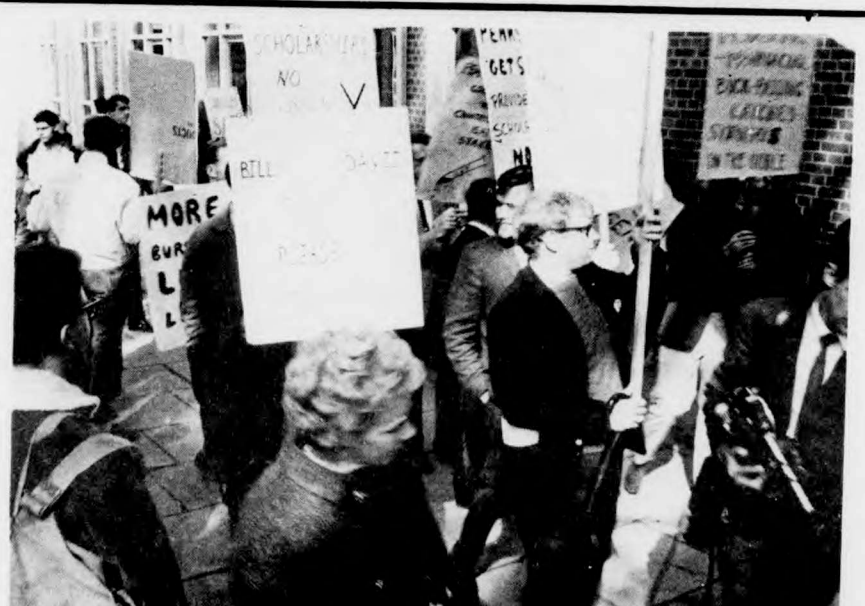
Students Protest S.A.P. and Cancellation of Federal Scholarships