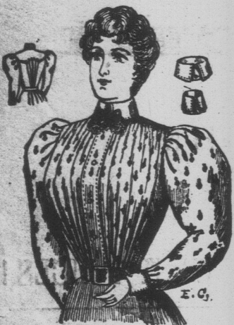
6781-Ladies' Shirt Waist.

Order Dress Patterns described and illustrated in these Columns as directed below.