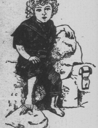
7000-Child's Bathing Suit.

The pattern, No. 6781, is cut in size for a 32, 34, 36, 38, 40 and 42 inch measure.