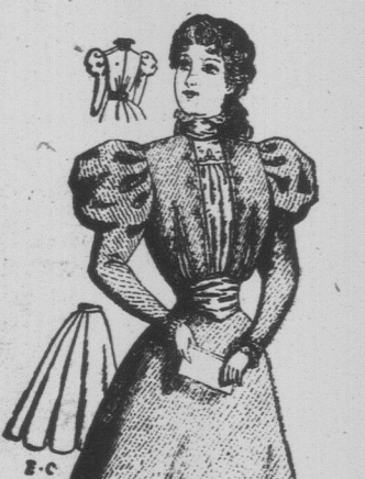
6042-Miss's Waist. 6874-Miss's Circular Skirt.

This pretty bathing suit is adapted to children of either sex. As illustrated it is made of flannel in a deep shade of red trimmed with white m-h-i-r braid.