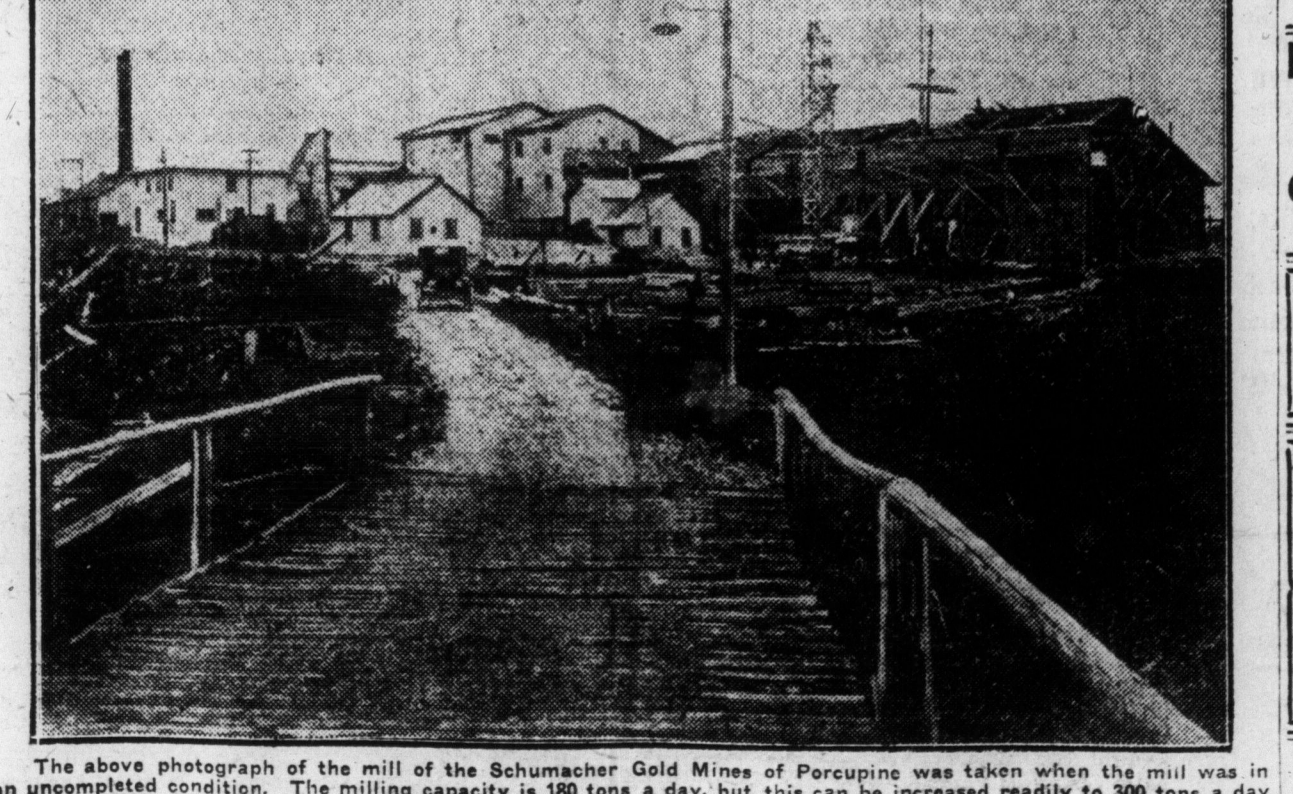
The above photograph of the mill of the Schumacher Gold Mines of Porcupine was taken when the mill was in an uncompleted condition. The milling capacity is 180 tons a day, but this can be increased readily to 300 tons a day by the installation of a Warding mill and a tube mill at an estimated cost of about $10,000. The mill will then be the fourth largest in the Porcupine camp.