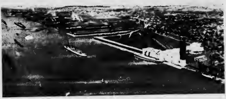
The new Ocean Terminals, Halifax

Halifax Alt. 58.9 Population 46,600, the capital of Nova Scotia and one of the Canadian Government Railways' chief terminal points. The city is substantially built on a peninsula, and has one of the finest and largest harbours 836.3 in the word, navigable at all seasons, where steamers and sailing ships of many nations may be seen. There are regular sailings for Europe, the West Indies, Boston, New York and coast ports.