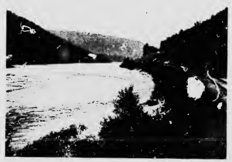
The Matapedia Valley

452.6 Matapedia Alt. 54.0 Shortly after leaving Causapscal, the route is through the Matapedia Valley following the course of the river for over twenty-two miles. Through a beautiful valley the Matapedia winds in graceful curves, singing the music of the waters as it goes. In the miles