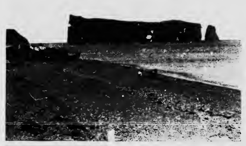
Perce and the Rock

Gaspe Peninsula has been described as a huge finger reaching out from the continent into the Gulf of St. Lawrence. In straightaway measurement, it has a length of about 120 miles and a breadth of some 90 miles in the widest part, with a total area of over 10,000 square miles. The Gaspe fisheries are regarded as the richest in the world. For centuries hardy fishermen have taken their annual toll in vast catches of codfish, and still there is no sign of depletion. Fishing and farming are frequently said to be industries which do not flourish side by side. However true this may have been in the past, it is only now partly true as regards Gaspe, for the fisher folk have discovered that those who sow may also reap, and while still following their chosen vocation they find time to raise good crops of potatoes and vegetables for their own use, and the finest of fodder for their cattle and horses. Practically the whole of the Peninsula is a fish and game preserve. The connection of the Quebec Oriental Railway at New Carlisle with the Atlantic, Quebec & Western Railway, making a through line from Matapedia to Gaspe, has led to some very encouraging agricultural and industrial development, and at many places the land is being cleared and tilled, while ambering is being carried on with increased