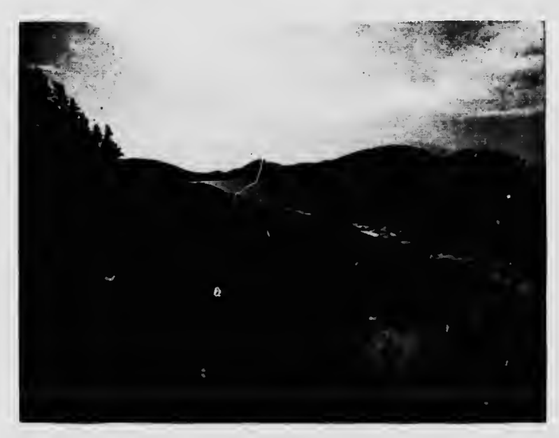
Bic the Beautiful

At Matane, lumbering is the principal industry, and there are several finely equipped mills that have a large annual output of saw lumber.