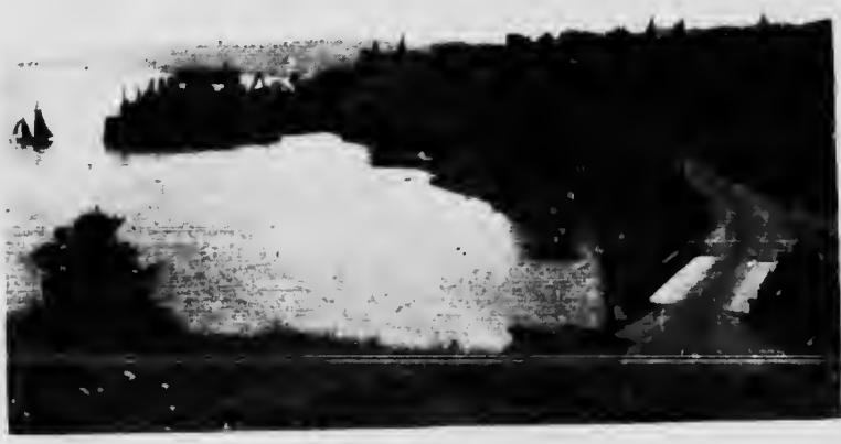
Mulgrave and the Strait of Canso

Cape Breton is usually spoken of as an island, but it actually consists of a number of islands. Water, fresh and salt, has been distributed very liberally in this part of the world, and it is to this that Cape Breton owes much of its charm. The land, of course, does its share as a part of the beautiful picture. For the summer visitor the island has everything to be wished for, bold scenery and fine prospects, charming vale and river districts, beautiful woods, romantic gorges, sparkling water-falls, sunny skies, delightful temperature and invigorating air. Nature has liberally endowed this section of the Dominion, for Cape Breton is very rich in minerals. The productive coal measures cover about two hundred and fifty square miles. Gypsum is found in many