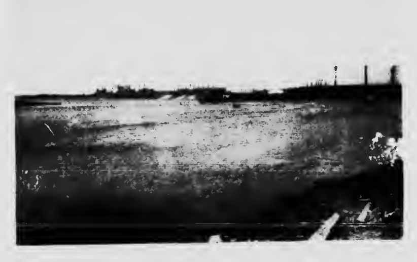
The Steel Works-Sydney

district that is making rapid strides along the highway of industrial development. Here are located the blast furnaces and immense plant of the Dominion Iron & Steel Co., the whole works forming practically a town of itself. It is also the head-quarters of its allied company. The Dominion Coal Company, operating 23 collieries at Glace Bay and New Waterford. The two make a big concern, owning collieries at Springhill, iron mines in Newfoundland, limestone quarries in Cape Breton, piers and pockets in all the important shipping ports on the Canadian Atlantic and St. Lawrence River, over 120 miles of railway and a line of steamships carrying millions of tons of coal and iron. The corporation also owns thousands of houses, runs its own general stores, has its own relief fund society and numerous up-to-date things that go to take care of a pay roll of sixteen thousand employees. Sydney has grown in a few years from a small town to a city of Dominion importance. For the visitor on pleasure bent, it has countless attractions. The summer climate is delightful, and although the summer is apt to be tardy it has a pleasant habit of lingering in the lap of autumn. The splendid harbour furnishes every opportunity for yachting, motor boating, canoeing, boating and fishing. Near the city are many trout streams and a multitude of desirable places for a day's outing. The hotel accommodation is excellent. The links of the Lingan Country Club have an established re-