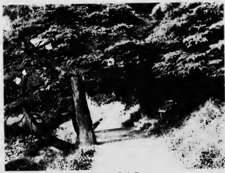
In Victoria Park, Truro

The Dominion Atlantic Railway runs to Windsor, the Annapolis Valley Land of Evangeline to Yarmouth.