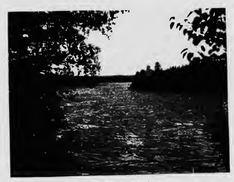
30,000,000 Feet of Lumber

Fredericton Alt. 35.0 Population 8,000. Fredericton, the capital of New Brunswick, is one of the fairest cities in Eastern Canada, picturesquely situated on the St John River, finely built and well maintained. It is a most pleasant place of sojourn, and there are many opportunities for enjoyment. In the midst of a fine farming country, Fredericton has many advantages as a distributing centre, and has also some large and important industries, including saw mills and woodworking factories, farm implements, canoes, boots and shoes, etc. The Provincial Parliament Buildings, the University of New Brunswick and the Provincial Normal School are located here.