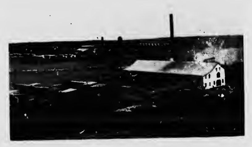
A New Brunswick Lumber Mill

Around the shores of La Baie de Chaleur the land is settled for many miles, and the picturesque hamlets and green pastures add to the beauty of the scene. The swell from the ocean breaks rhythmically upon smooth, sandy beaches that tempt the bather. There are many coves and harbours where the boating is alluring and shorn of its risks. Sheltered at its mouth by the islands of Miscou and Shippegan, and restless as may be the sea beyond, the yachtsman may guide his craft over the whitecaps when a stiff breeze is blowing, while there are often summer days when the bay is so placid that the small motor boat may safely venture into the open. The New Brunswick shore is followed by the line of the Government Railways from Campbellton to Bathurst, and