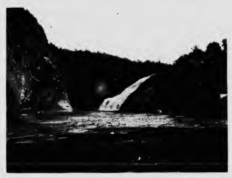
The Falls of Riviere du Loup

277.0 Riviere du Loup Alt. 314.5 Population 7,000. Riviere du Loup is an important railway centre, being a divisional point on the line of the Canadian Government Railways. The Temiscouata Railway runs from here to Edmundston and Connor's, N.B. Riviere du Loup, which is incorporated as the town of Fraserville, extends to the mighty St. Lawrence, here like a broad sea with all its possibilities—bathing, boating and fishing, with shooting in the proper season. There is good summer hotel accommodation. Apart from its own at-