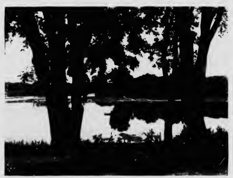
On the Nicolet River

A century ago, in the fierce days of the French Revolution, when a vandal mob trampled under foot all that savoured of culture and refinement, great havoc was wrought in the world of art. They sacked the palaces and destroyed works which centuries of labour would not suffice to replace. Paintings which had been the triumphs of world-famous artists were thrown into the streets to be trodden under foot. Others were torn from the walls and rolled up in bundles to be sold for enough money to buy drink.