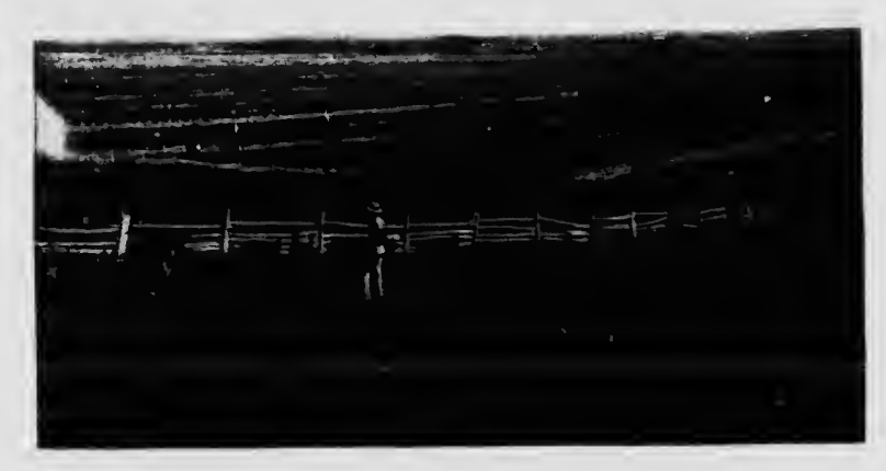
Long Narrow Farms