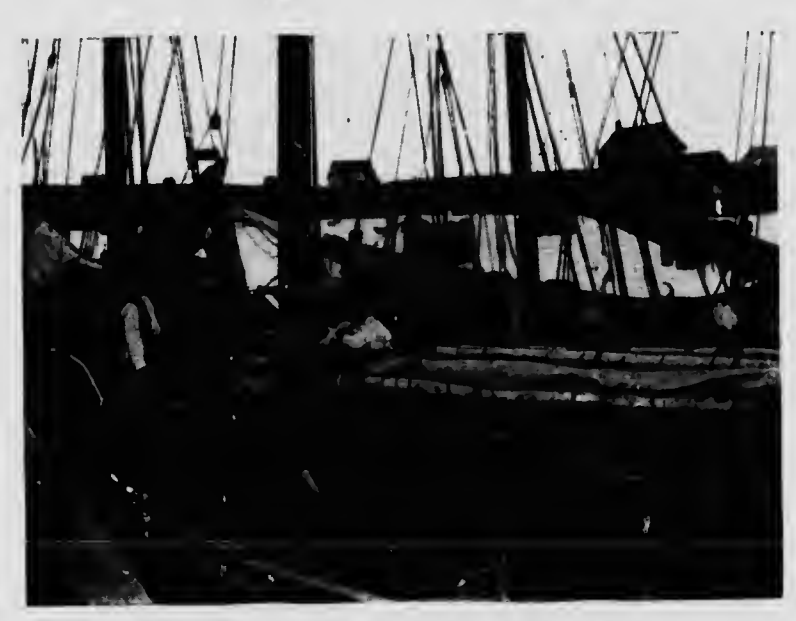
With the Deep Sea Fishermen-Prince Edward Island