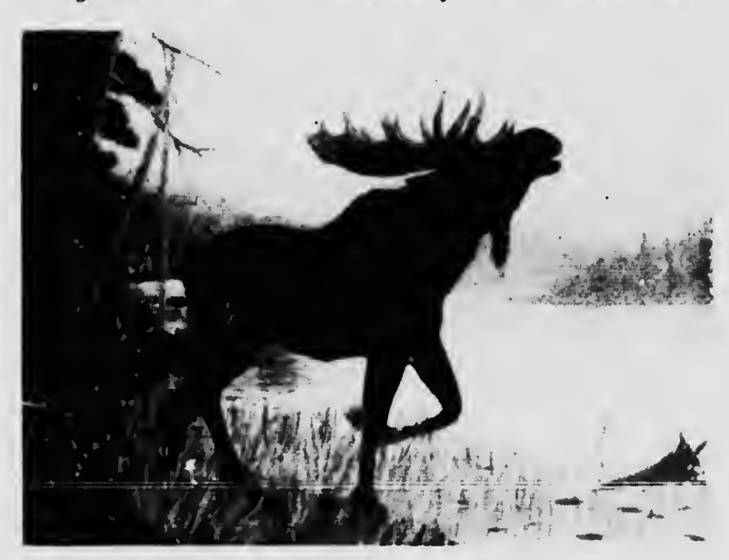
The Monarch of the Forest

528.2 Bathurst Alt. 47.9 Population 3,000. Beautifully situated on the mouth of the Nepisiquit River. Hitherto known principally as a summer resort. Bathurst has within the past two years taken a big stride in the industrial world. There is a large pulp and paper mill giving employment to many operatives. It is estimated Bathurst mines are capable of producing 600,000 tons of iron ore annually. The mine is furnished