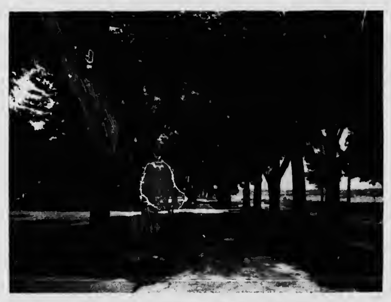
One of the Beautiful Elm-lined Streets of Fredericton

pression of what is really a fine part of New Brunswick. There is a rich farming and fishing district all along the coast, and there are rivers, of which only the headwaters are crossed by the railway. The Richibucto is one of these, and the village of the same name, twenty-seven miles from Kent Junction, is reached by the Kent Northern Railway. It has much to commend it as a summer