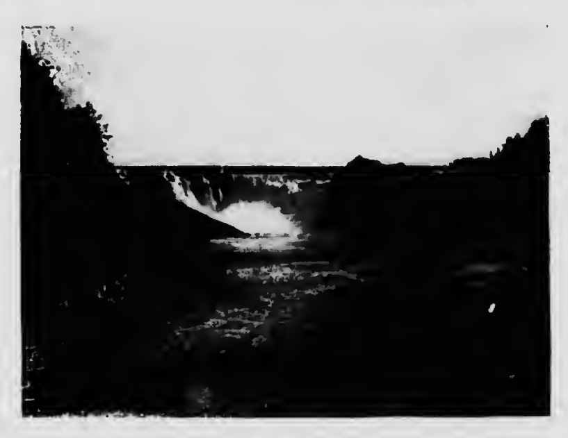
The Falls of the Chaudiere River