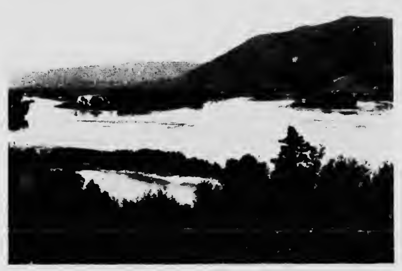
The Restigouche above Campbellton

and developing. At the junction of the Matapedia River with the Restigouche is Matapedia station and village. Close at hand is the house of the Restigouche Salmon Club, the members of which are men to whom money is no object in the carrying out of their ideas. The club is composed to a large extent of wealthy residents of New York and other cities of the United States, who are willing to pay well for what has been termed the "Sport of Kings." This part of the Matapedia is a place of singular beauty, and the charm of