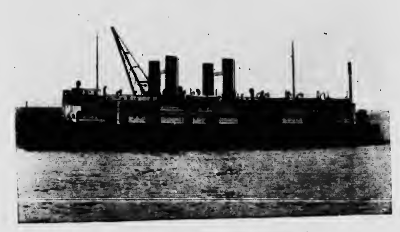
The Car Ferry-S.S. "Prince Edward Island"

of thoroughly appreciating its many attractions.