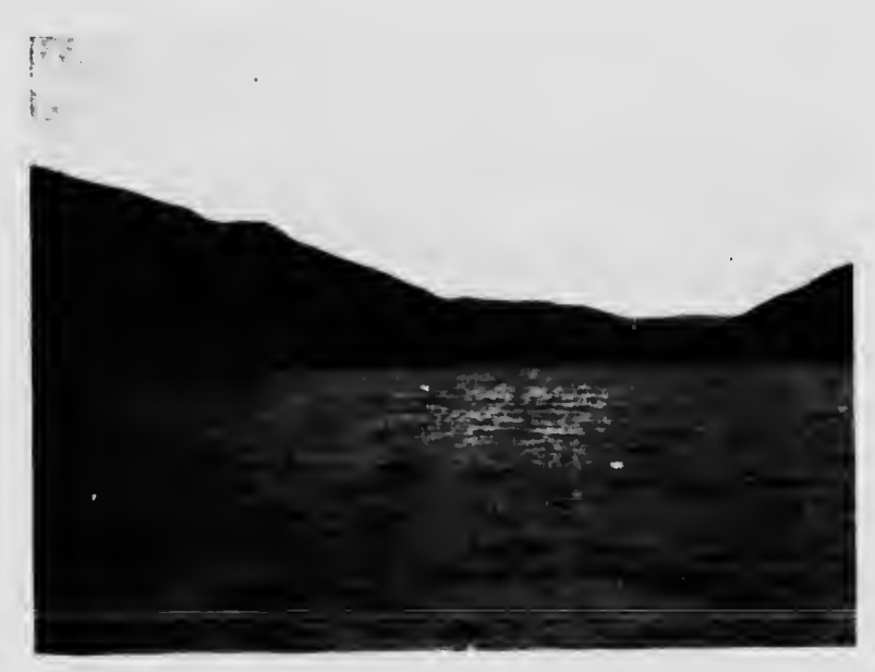
The Ingonish River

Louisbourg is the terminus of this line, and the quaint old town is visited every summer by hundreds of tourists. There still remain the grass-grown ruins of its former greatness, but the city as the French built it has vanished from the face of the earth. A monument erected by the Society of Colonial Wars commemorates the first capture of Louisbourg by Pepperell's forces in 1745. Tourid the rock-bound shores the Atlantic surges sound the control requiem of the city made desolate. Some curious, old-time and ments of war have been found around the site of old Louisbourg. A Marconi wireless station is now established there.