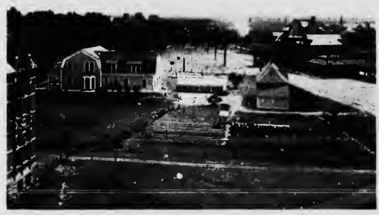
The Government Railways Station and Grounds, Moncton, N.B.

Memramcook is the centre of a fine agricultural district settled by Acadian French. At College Bridge will be seen the stately buildings of St. Joseph's University.