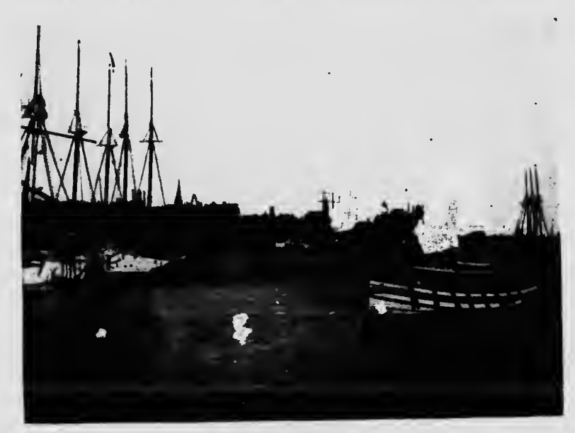
The City Water Front, St. John

Woodstock Alt. 177 0 Population 4,000. The St. John and Quebec Railway, now operated by the Government Railways, from Fredericton to Woodstock and Centreville follows the course of the St. John River to Woodstock. It is another of the many picturesque railway journeys in this part of