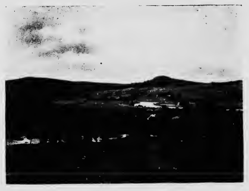
The Valley of the Kennebecasis

Almost completely destroyed by the great fire of 1877, old St. John with all her romantic history is lost, but new St. John is a handsomely built and substantial city with wide, modern business blocks, up-to-date stores and beautiful residences. The in-