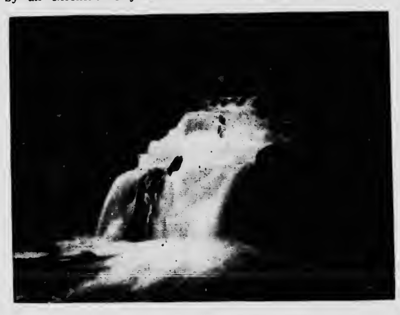
Joe Howe Falls-Victoria Park, Truro

834.9 Dartmouth Alt. 14.5 Population 5,100, is directly opposite Halifax and connected with that city by an excellent ferry service. It has several well-established