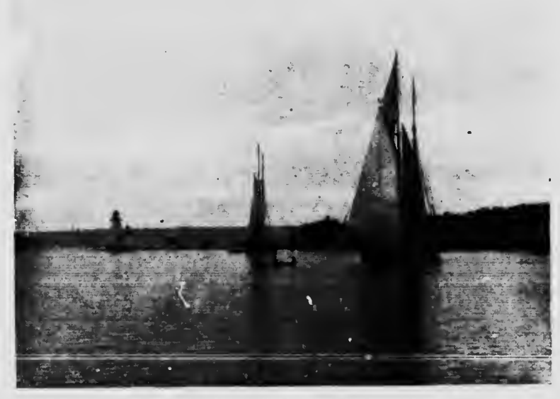
Entrance to Baddeck Harbour-Bras d'Or Lake

It has been said of the Bras d'Or that it is the most beautiful salt water lake ever seen. The substance of Warner's comment is seen to be true by all who visit these shores. "The water runs into lovely bays and lagoons, having slender tongues of land and picturesque islands. It has all the pleasantness of a fresh water lake with all the advantages of a salt one." There is practically no tide, the comparatively narrow sea entrances acting to resist the flow of water out and in. The difference in level is usually sess than a foot.