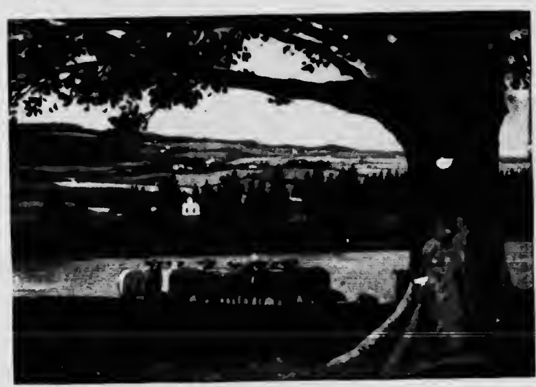
Sweet Pastoral Scenery-Prince Edward Island

Summerside Alt. 8.0. Population 3.000. The town of Summerside is second in point of population. It has excellent stores, handsome residences, and much to attract the summer visitor. From a hill in the rear of Summerside is a glorious prospect of the country and of the waters to the north and south. Looking one way, Bedeque Bay is seen with all its attractive surroundings, while beyond it lies Northumberland Strait, with the coast line of New Brunswick in the distance.