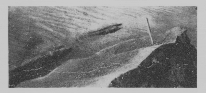
Figure II. Ripple-marks on a block of limestone from the face of the cliff shown in Figure I.