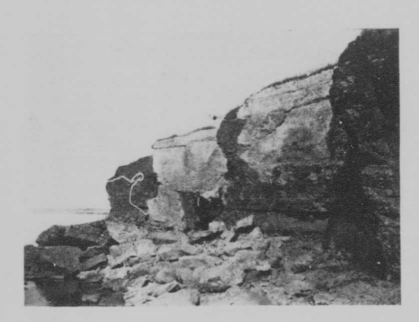
Figure I. Devonian limestone cliffs on Snake Island, Lake Winnipegosis.