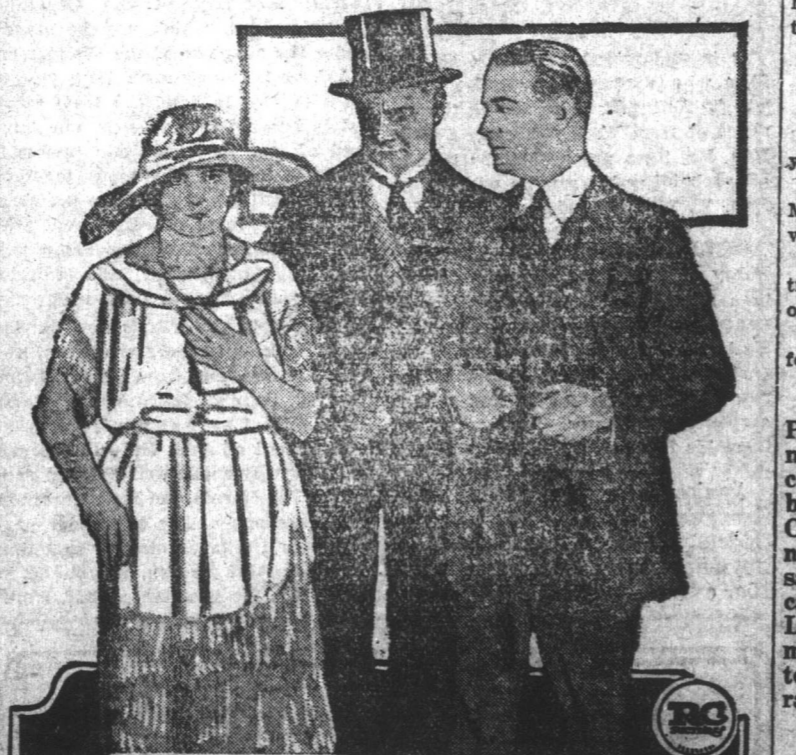
BILLIE DOVE, CHARLES CRAIG and HUNTLY GORDON in "AT THE STAGE DOOR" A N-R-C PICTURE