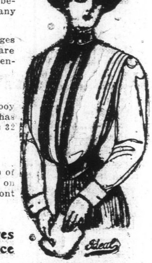
Illustration 1204 W. JOHNSTONE WALKER & CO. 263-267 Jasper Avenue East Phones 1351, 2932

IMPORTANT: - We prepay express charges to your nearest express or post office Illustration 1208