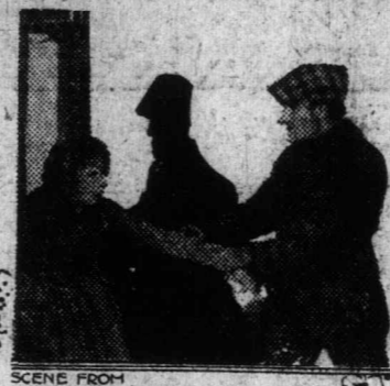
SCENE FROM DUFF GRIFITH'S "BROKEN BLOSSOMS" AT THE HIPPODROME NEXT WEEK

The Galt Industrial Housing Co., Ltd., is being organized and subscriptions are called for $15,000 of