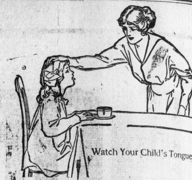
Watch Your Child's Tongue!

The case of each settler who testified yesterday is now one of almost utter destitution. Their stories were pathetic. With one exception these settlers came into the camp with sums of money exceeding $500, which did not include Government assistance. They have been here for more than a year. They find that they cannot obtain enough from ten acres, if it happens to be cleared, to support themselves and families, and it