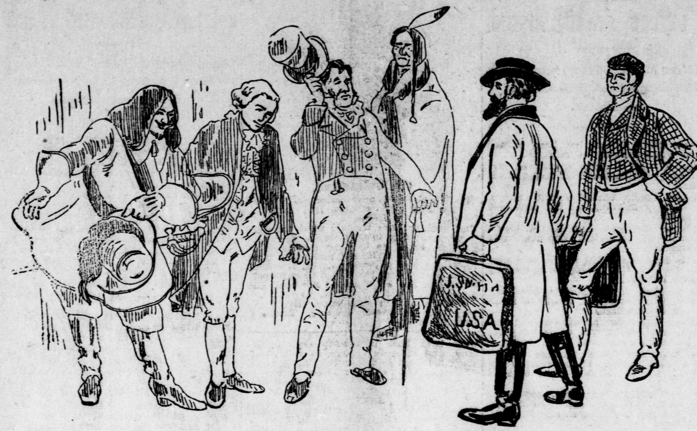
SHADES OF THE IMMIGRANTS OF THE PAST, TO THE IMMIGRANTS OF TODAY: "WELCOME."

St. Louis, Mo., March 5.—In the matter of the threatened Wabash strike, everything now hinges on the injunction, which the labor leaders will attempt to have dissolved today, and until this shall be done away with, there can be no strike, for the leaders have agreed to obey the court's orders.