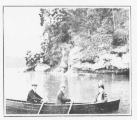
BOATING SCENE -- DEPARTURE BAY

As soon as the question of removal arose, the old residents, without exception, evinced a warm desire for the preservation of their familiar sentinel block house, and through the efforts mainly of the late Chief Constable Stewart, backed by all whose support he sought, the building is