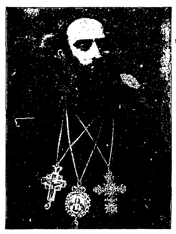
THE PATRIARCH OF ARMENIA. See page 146.

London, alone told him that nothing could justify the breaking of such a promise as he had given to his confiding servant.