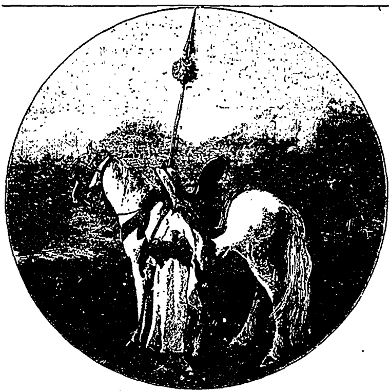
GOD'S FOOTPRINTS. (See page 162.)

sure to die," and there wouldn't be enough left to raise a respectable family.