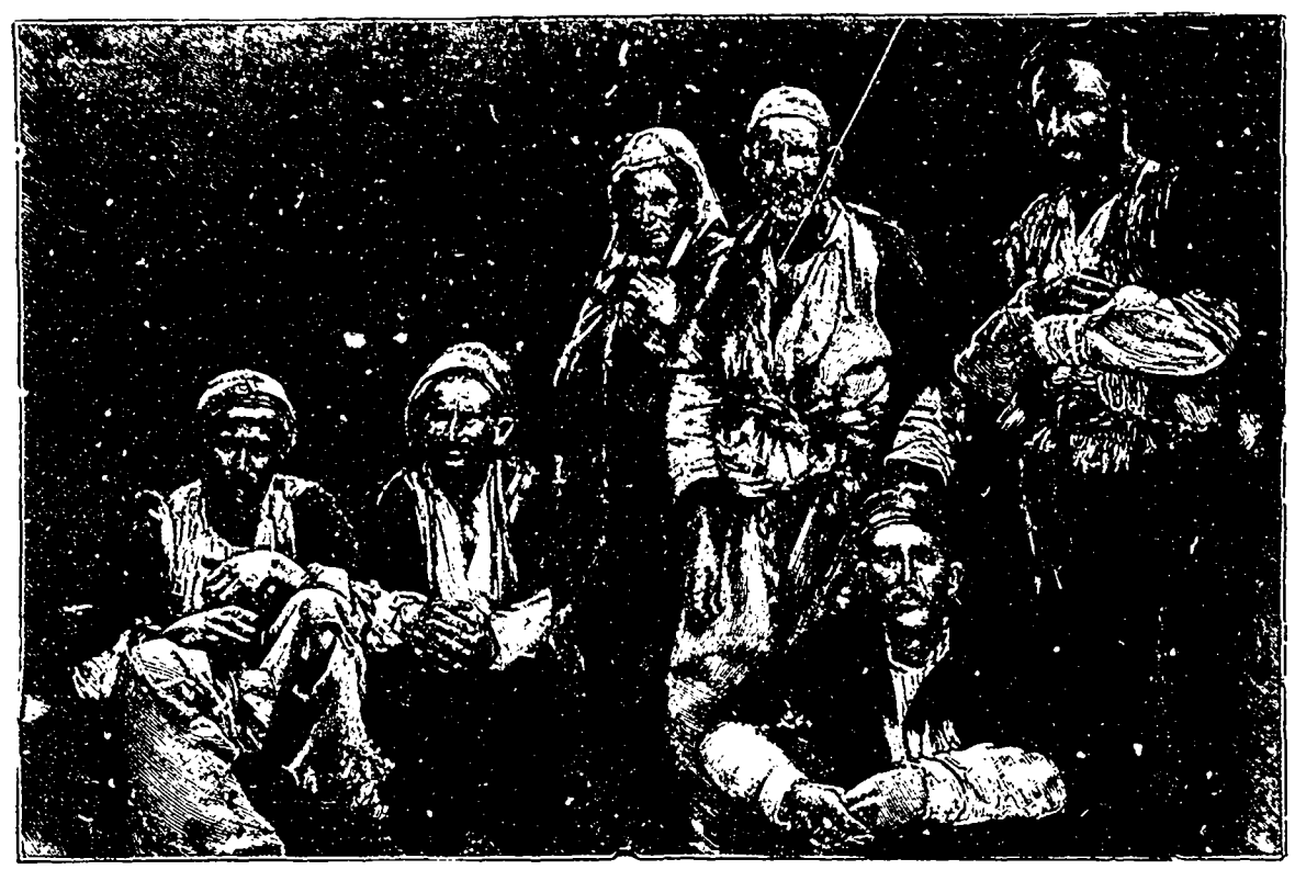
GROUP OF ARMENIANS.

driven from their devastated homes by the ruthless Kurds from the mountains, they have carried into other lands the same commercial instincts as the Jew, the same keenness in trade, the same faculty of growing rich; and wherever they are met with they are still Armenians, the ancestral type unchanged; but, at the same time, always peaceable and submissive subjects.