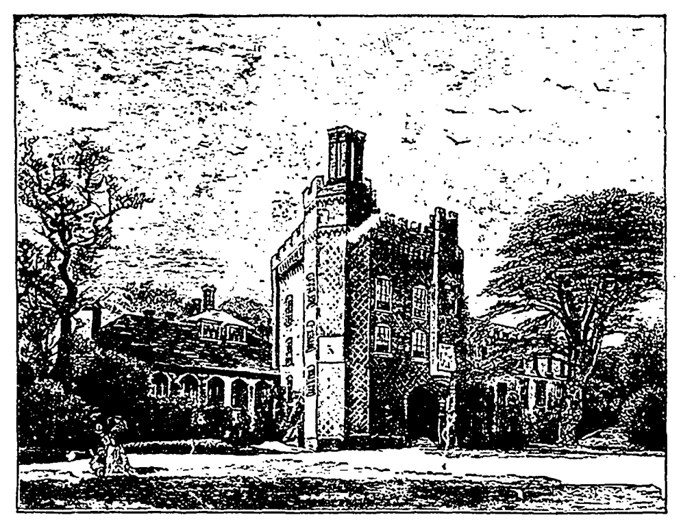
FARNHAM CASTLE.—See page 153.