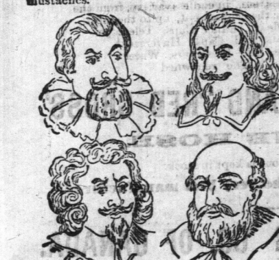
FOUR GOOD BEARDS.