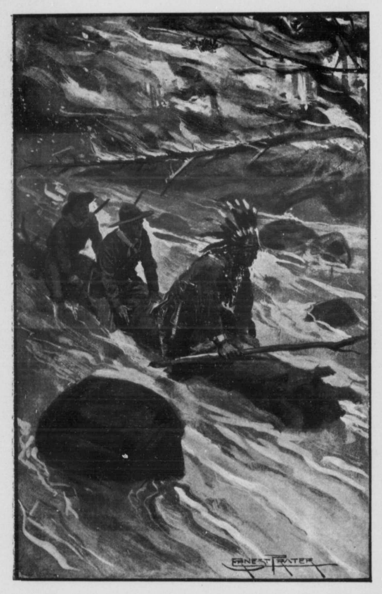
"'STICK TIGHT FOR ALL YOU'RE WORTH!' JACK CALLED ABOVE THE NOISE OF THE WATERS THAT LEAPED AROUND."