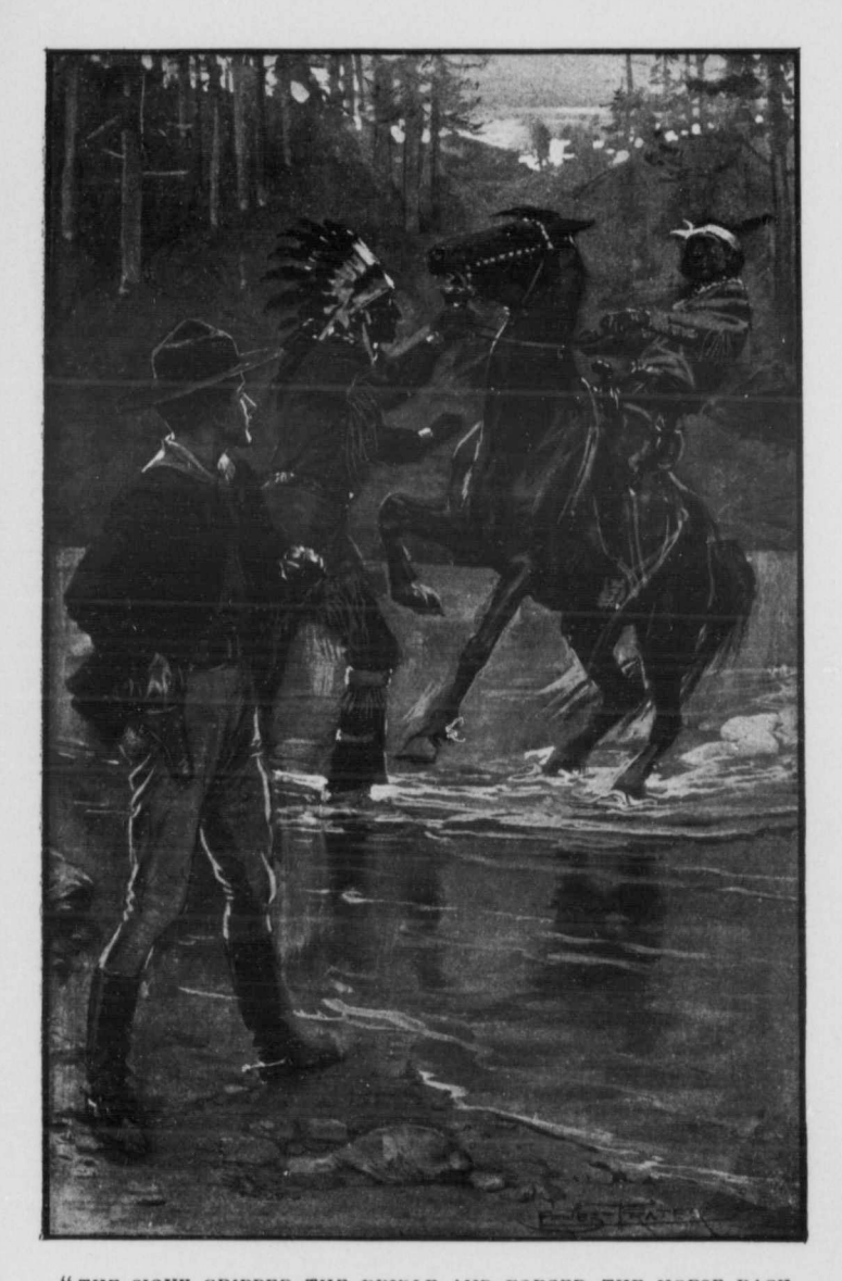
"THE SIOUX GRIPPED THE BRIDLE AND FORCED THE HORSE BACK ON ITS HAUNCHES." [p. 256.