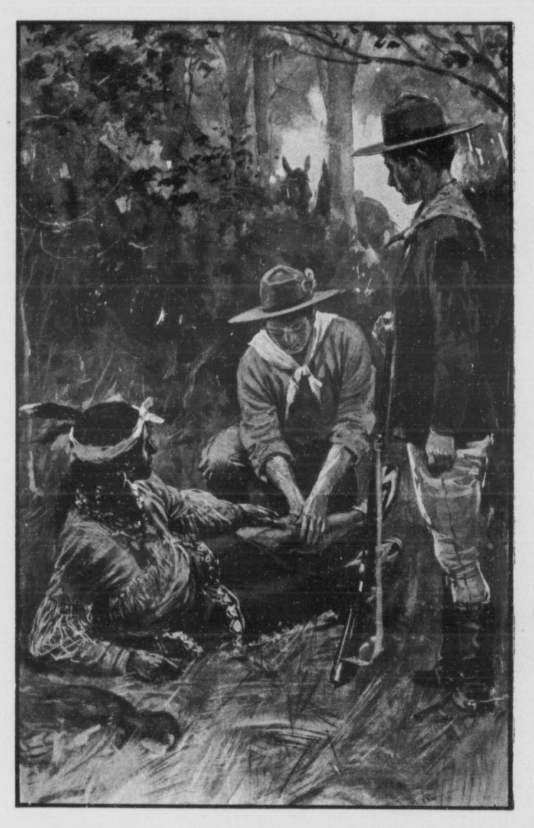
"WHITE FANG, GIVE AN ACCOUNT OF YOURSELF WHILE I TIE UP THE LEG."