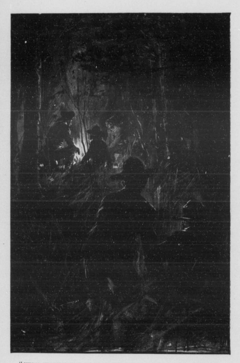
"VERY WARILY THE BOYS CREPT THROUGH THE BUSH TOWARDS THE LIGHT." [p. 296.