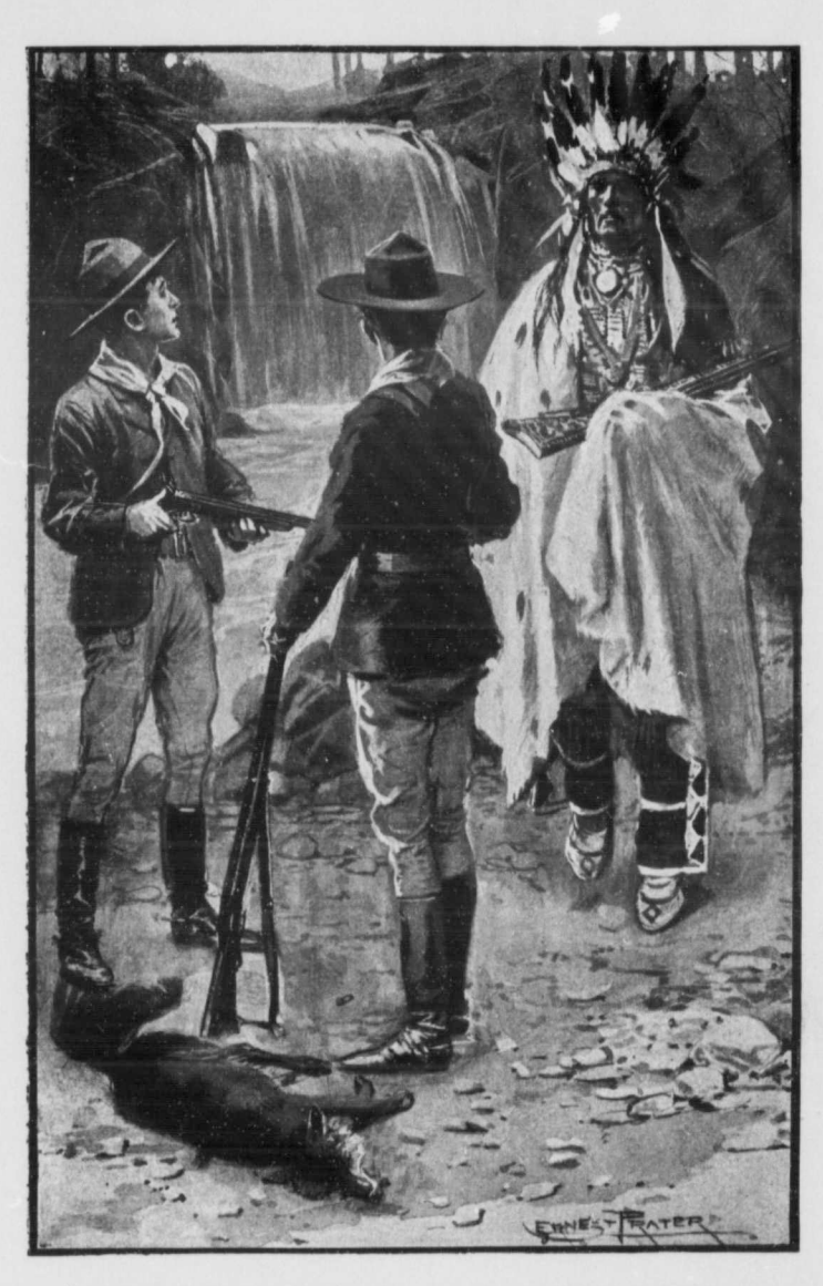
"INSTANTLY THE BOYS STARTED UP FROM WHERE THEY WERE KNEELING BY THE FOX, AND FACED THE INTRUDER."