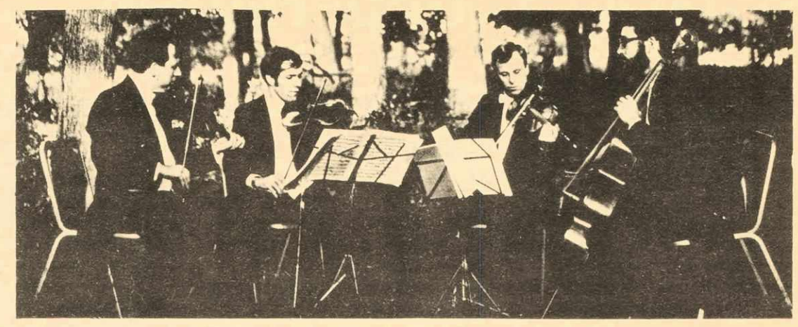
The Vachy String Quartet in concert in the woods. They will play in the McInnes Room on November 19th at 8:30 p.m. as part of the Beethoven Festival.

The third concert features a unique group of artists, The New York Chamber Soloists. Created