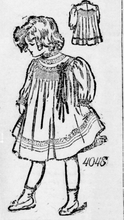
A ATTRACTIVE GOWN FOR A SMALL MAID.—4048.

Novelty is as much sought in children's frocks as in dresses for the woman of fashion. A charming little dress in India linen is pictured, tucked and inset with Valenciennes lace.