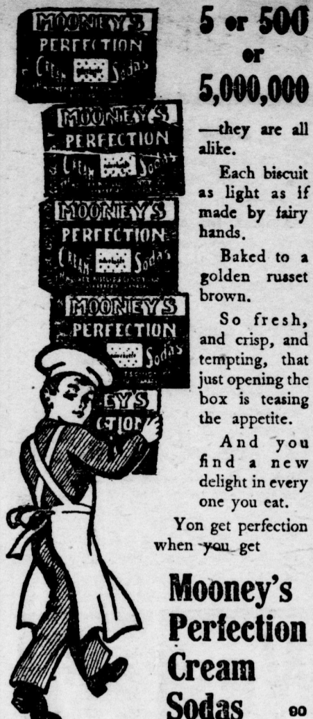
Mooney's Perfection Cream Sodas

Shortly after the departure of Madame Duvivier from the ball, Monsieur du Tillet made his adieux and was soon knocking at her door. He was at once admitted to the room where she, having removed her wraps, was stand-